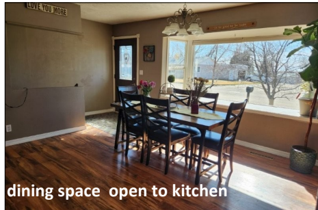
dining space open to kitchen