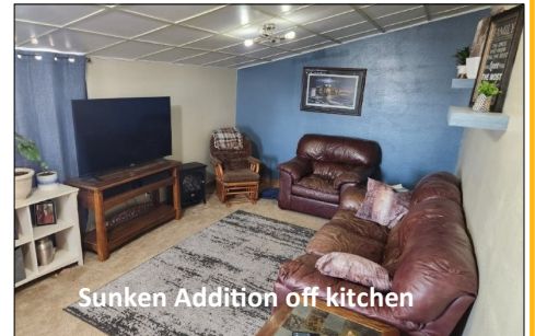
Sunken Addition off kitchen

Year Built: 1963 Remodeled 1978 & again later