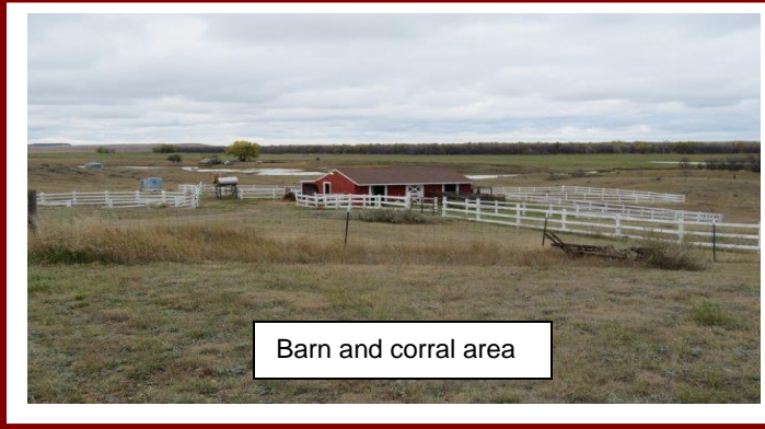
Barn and corral area