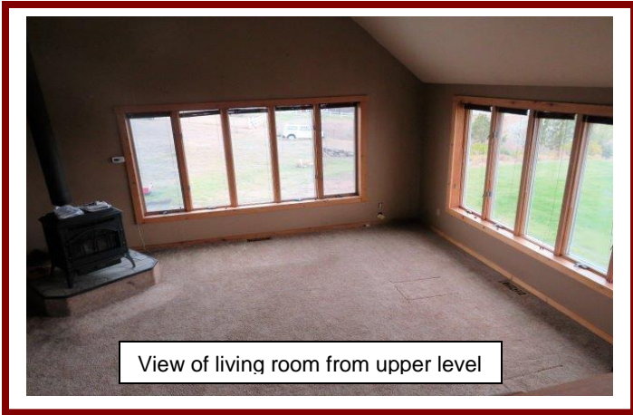
View of living room from upper level