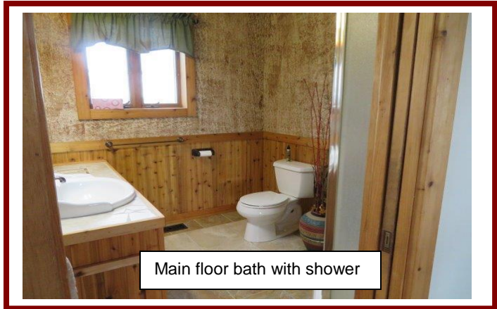
Main floor bath with shower