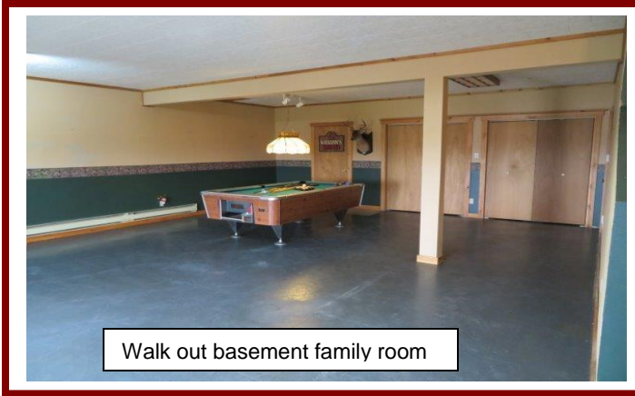
Walk out basement family room