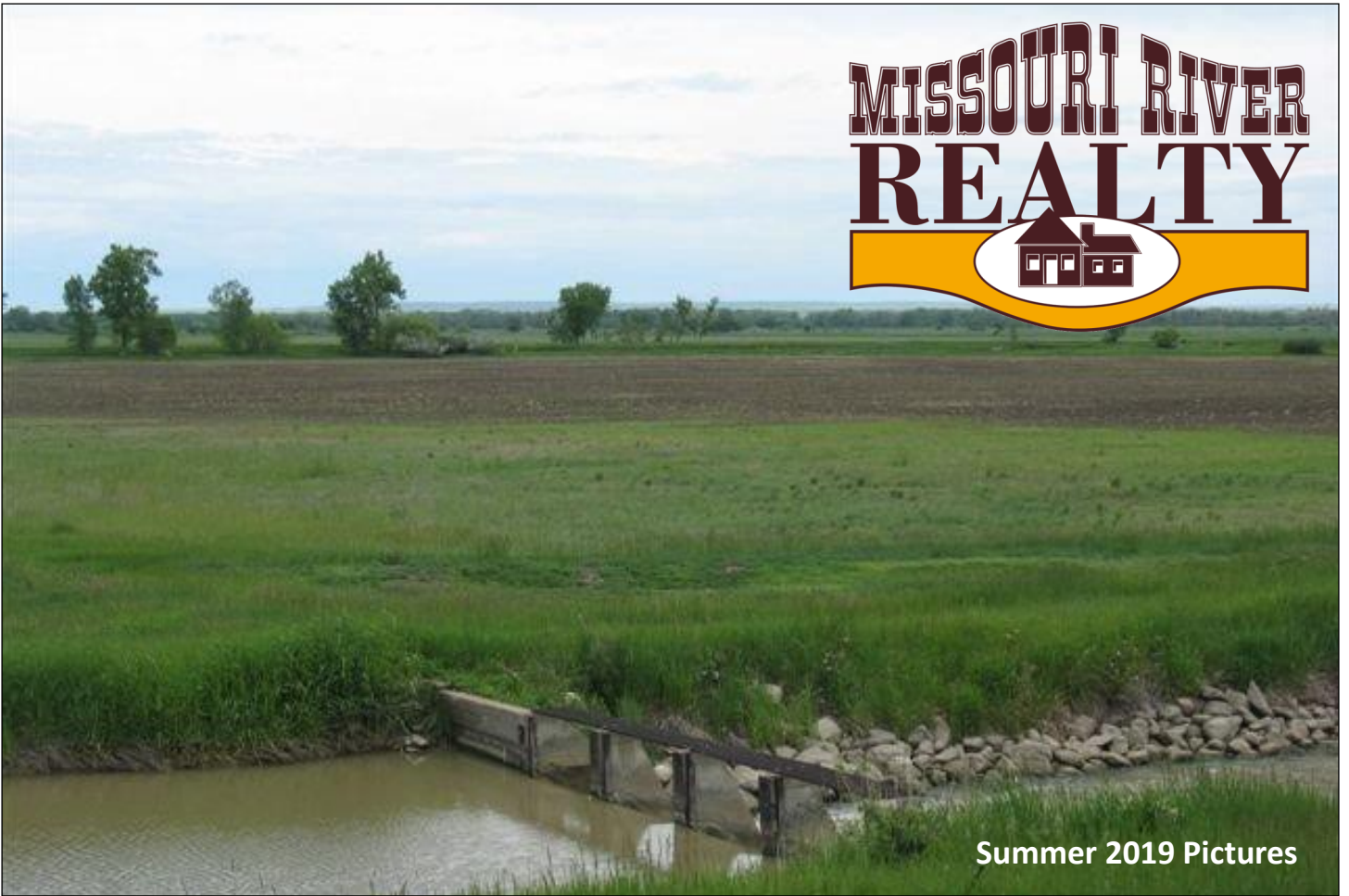
Summer 2019 Pictures