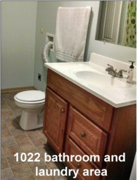
1022 bathroom and laundry area