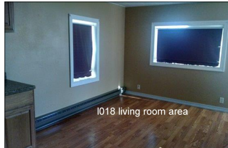
1018 living room area