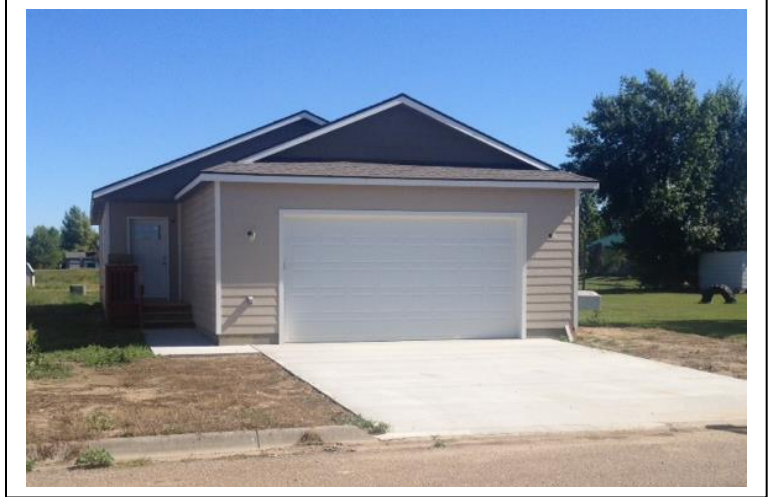
Listing # 129MR

COMMENTS: Enjoy living in a newly constructed home with the conveniences of everything you need on just one level! Attached 2 car garage, vaulted ceiling, oversized walk-in shower and an open floor plan.