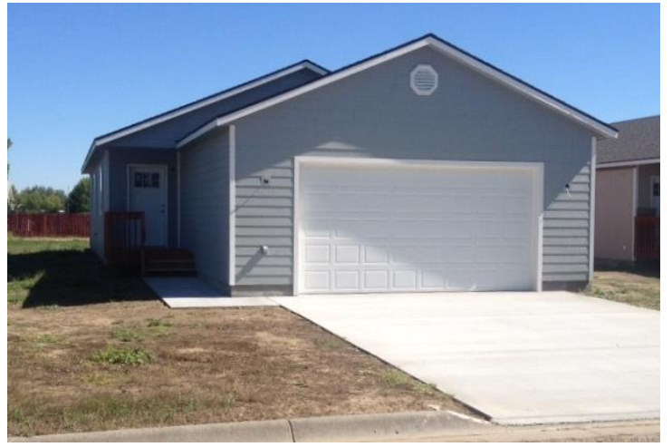
Listing # 128MR

COMMENTS: Enjoy living in a newly constructed home with the conveniences of everything you need on just one level! Attached 2 car garage, vaulted ceiling, oversized walk-in shower and an open floor plan.